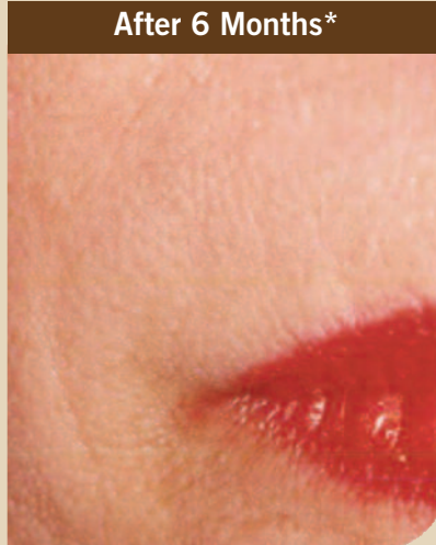
After 6 Months*